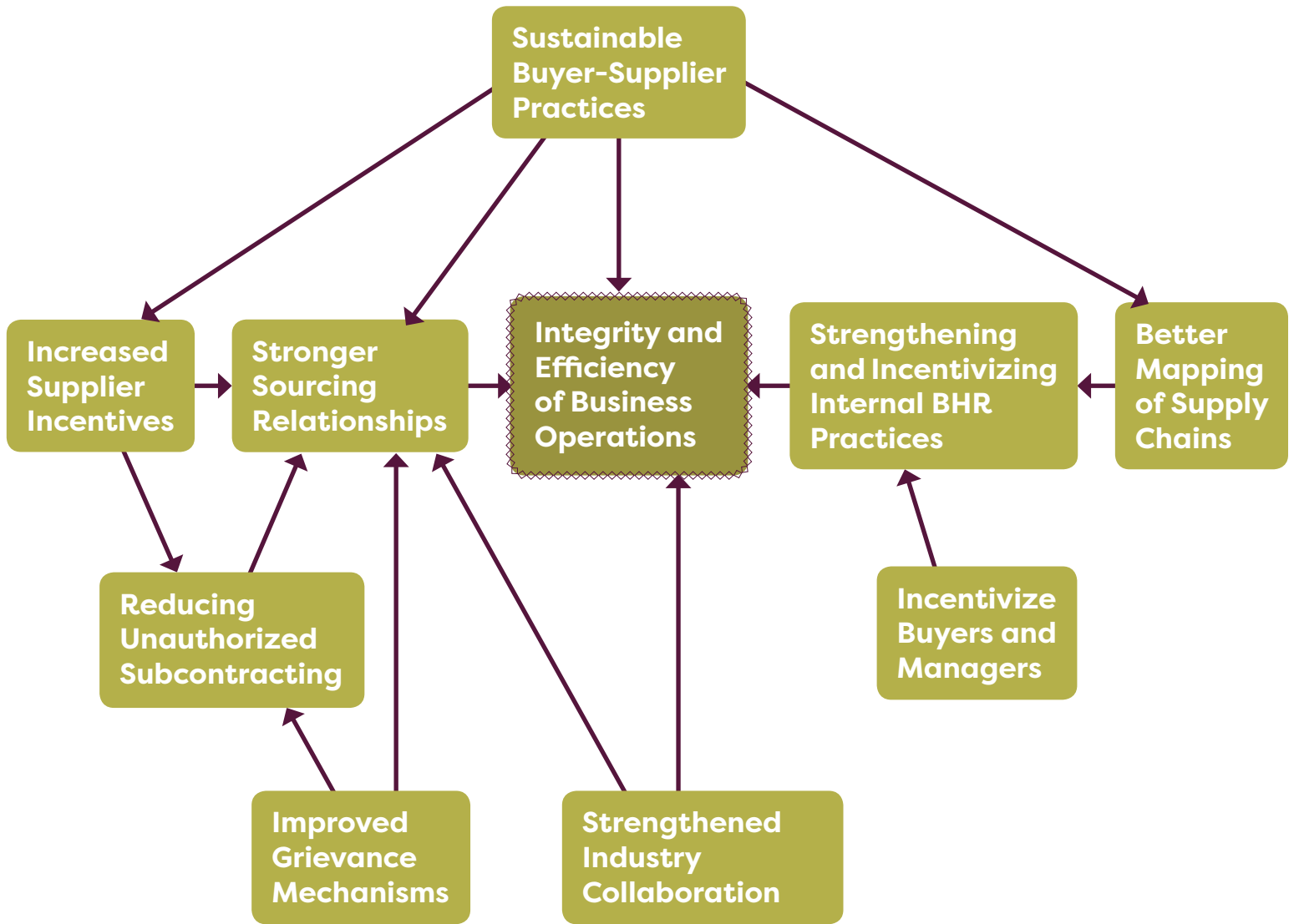
FIGURE 2: CONTRIBUTING ELEMENTS TO EFFICIENCY AND INTEGRITY OF BUSINESS OPERATIONS